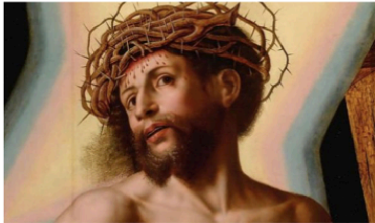
The 16th-Century work is by leading Flemish Renaissance painter Jan Sanders van Hemessen