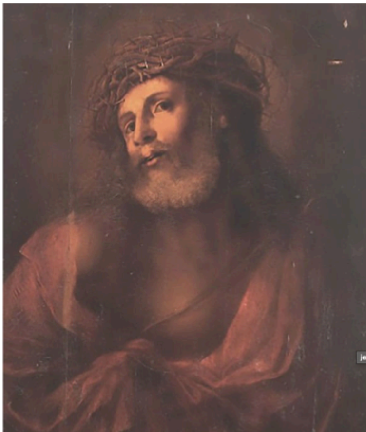
How the painting looked before